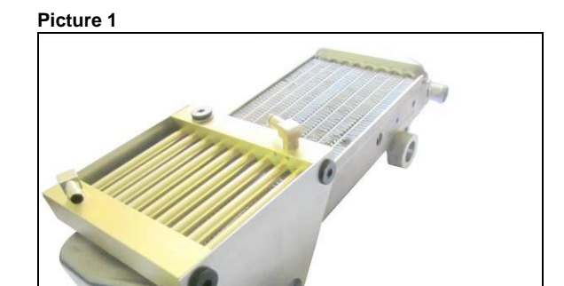
<u>Step 2:</u> Install the oil-cooler at the bottom portion of the Left radiator (Like Picture 1, 2 and 3)

Remove the coolant. Remove the left side radiator shroud and the bolts at the front of the radiator, also remove the oil filter cap.