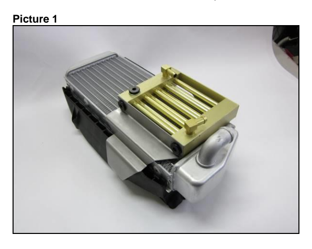
Step 2: Install the oil-cooler at the bottom portion of the left radiator (like picture 1, 2).

Remove the coolant. Remove the left side radiator shroud and the bolts at the front of the radiator, also remove the oil filter cap.