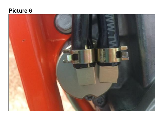
<u>Step 5:</u> Install the oil cooler hoses like the assembly diagram (like picture 7 and 8)

Hose 1 connects oil-out from the filter cap to oil-in on the radiator (cut the hose to the length). Hose 2 connects oil-out from the radiator to oil-in on the filter cap (cut the hose to the length)